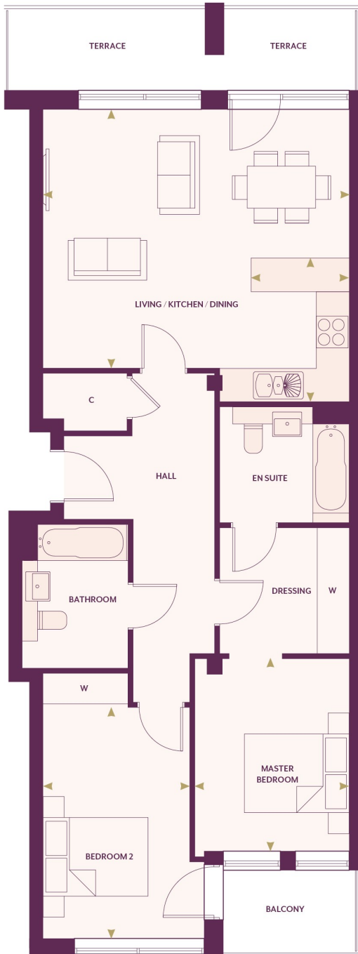
4 TH FLOOR