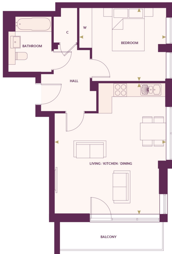
4 TH FLOOR